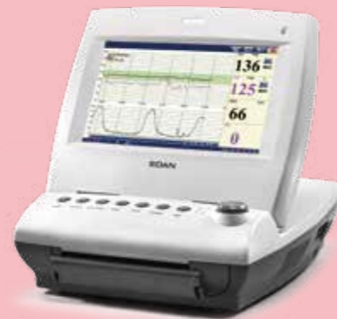
F6 Fetal & Maternal Monitor