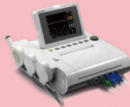
F3 Fetal Monitor